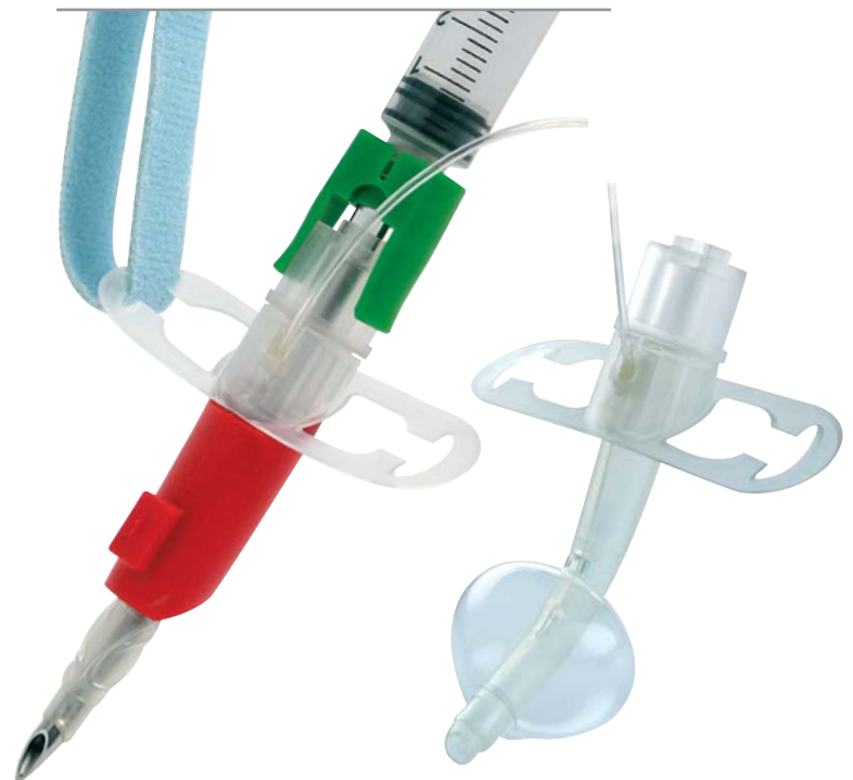
Quicktrach II with cuff complete set, sterile