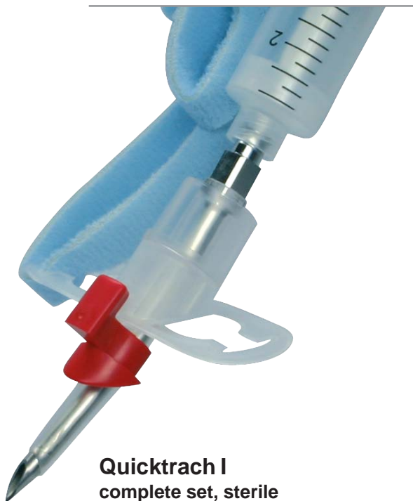
Quicktrach I complete set, sterile